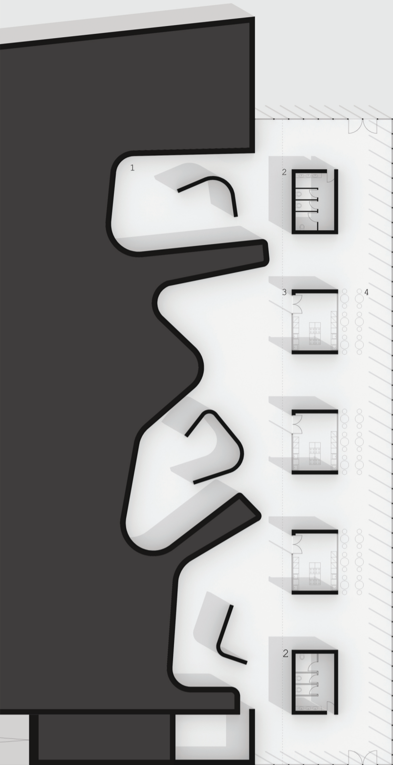
PIANTA SCALE 1:200